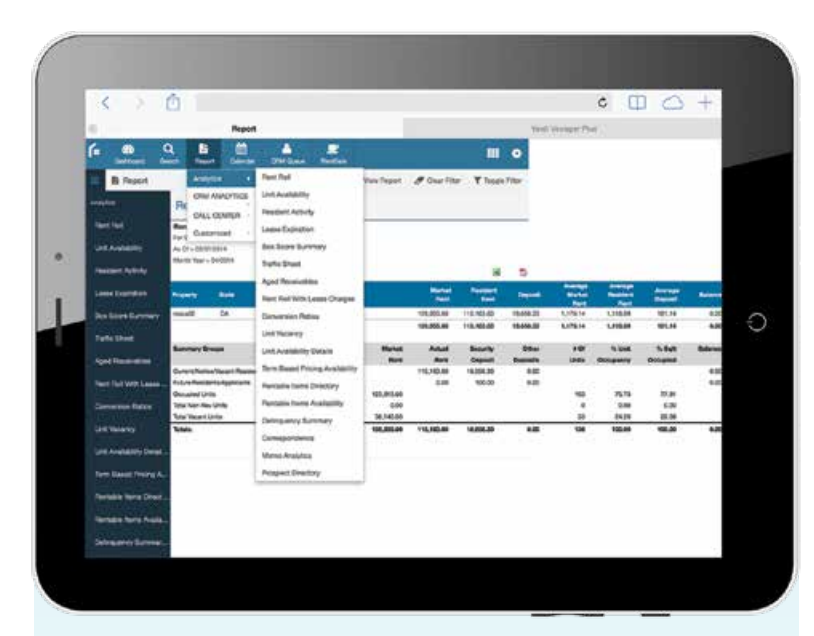
Access your dashboards, contacts, leads, calendar and leasing activity with a single tap.

RENTCafé CRM Single Family Homes is an end-to-end leasing and customer relationship management solution that allows you to conduct prospect and resident services from your tablet or desktop, with instant real-time data from Voyager. Your contact, lead, lease, resident and property data is packaged in an intuitive and mobile format. Get automated leasing and CRM activities in one integrated, transparent system, offering total visibility into your leasing activities. Leasing managers can easily step prospects through the leasing cycle from initial contact through online lease execution, as well as promptly assist residents during lease renewal and maintenance requests — without being tied to a desktop.