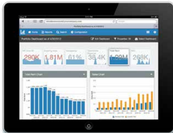
Dashboards with operational data, all at your fingertips.

As a browser-agnostic, mobile-friendly platform, Orion delivers robust reporting and dashboards to your tablet and desktop computer with equal ease.